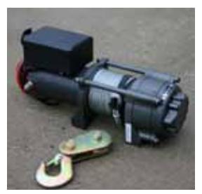
May require additional components eg pulleys depending on model of ATV

All Quad-X front mount systems require a manual or electric lift. Electric lift is easier, quicker and smoother with controls located at the handlebars to lift/lower the attachments while moving. If you want to use the lift for pulling heavier loads or using the front bucket, the ATV winch is recommended.