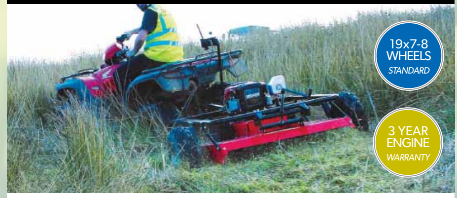
Briggs & Stratton engine options: