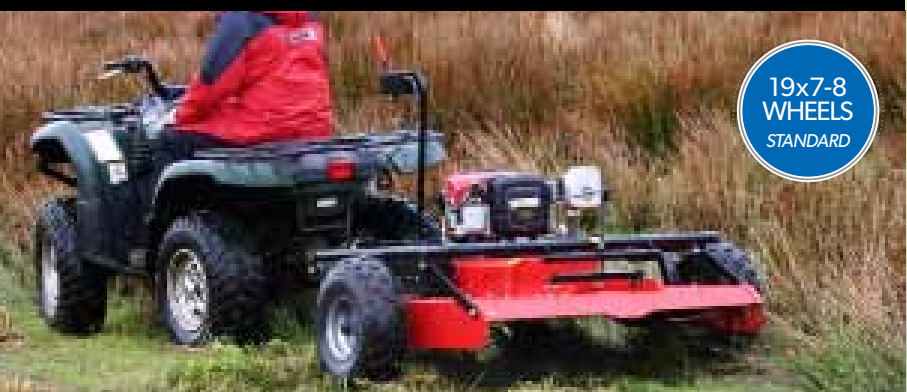
Briggs & Stratton engine options: